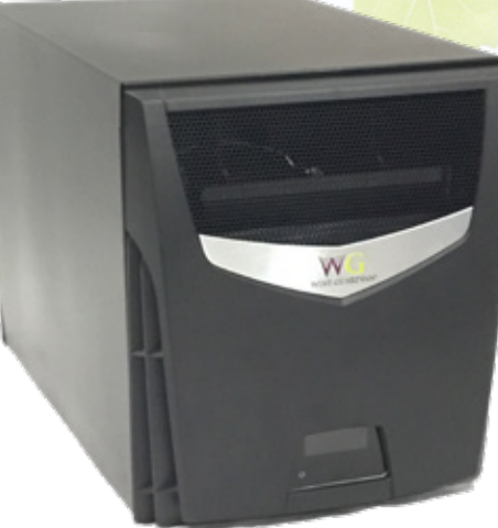
TTW unit out of racking