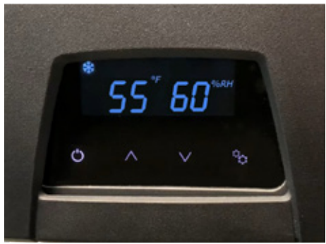
Front Digital Display