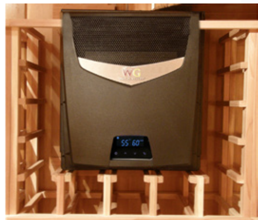
Front View in Racking